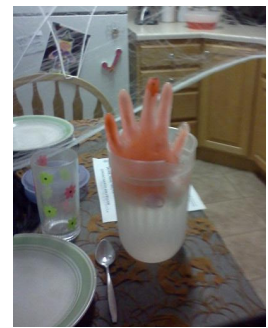
Bloody floating fingers (Apt 8)